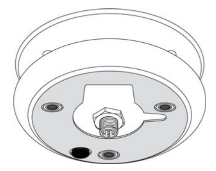
Figure 2 – WSO100 Interface Connector

The Maretron WSO100 provides a connection to an NMEA 2000<sup>®</sup> interface through a connector that can be found on the bottom of the device (see Figure 2).